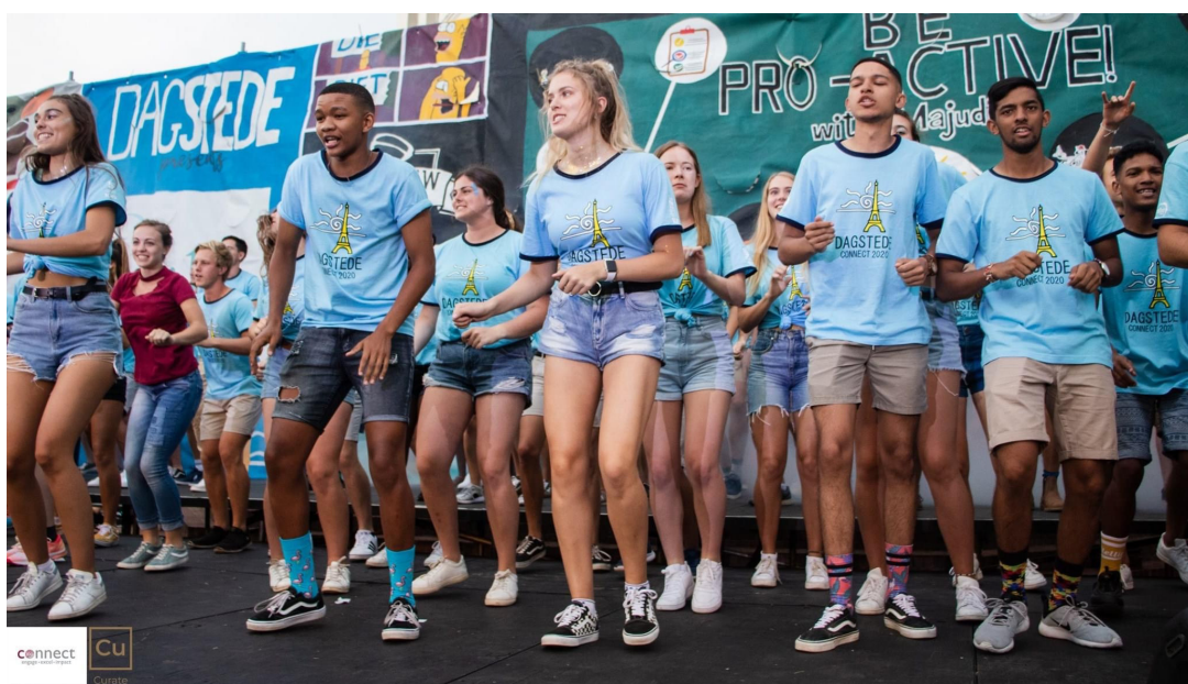
Dagstede 2019 (Dagbreek & Heemstede)

The annual Vensters event is set to take place on the 12/13th of March and for 2021 it is our privilege to be partnered with not only one, but two student communities. Our partners include Huis Francie van Zijl and Osler PSO. With hard work and determination we are convinced that we as DAGFRANSLER will be able to walk away with the number one position for Venster this year.